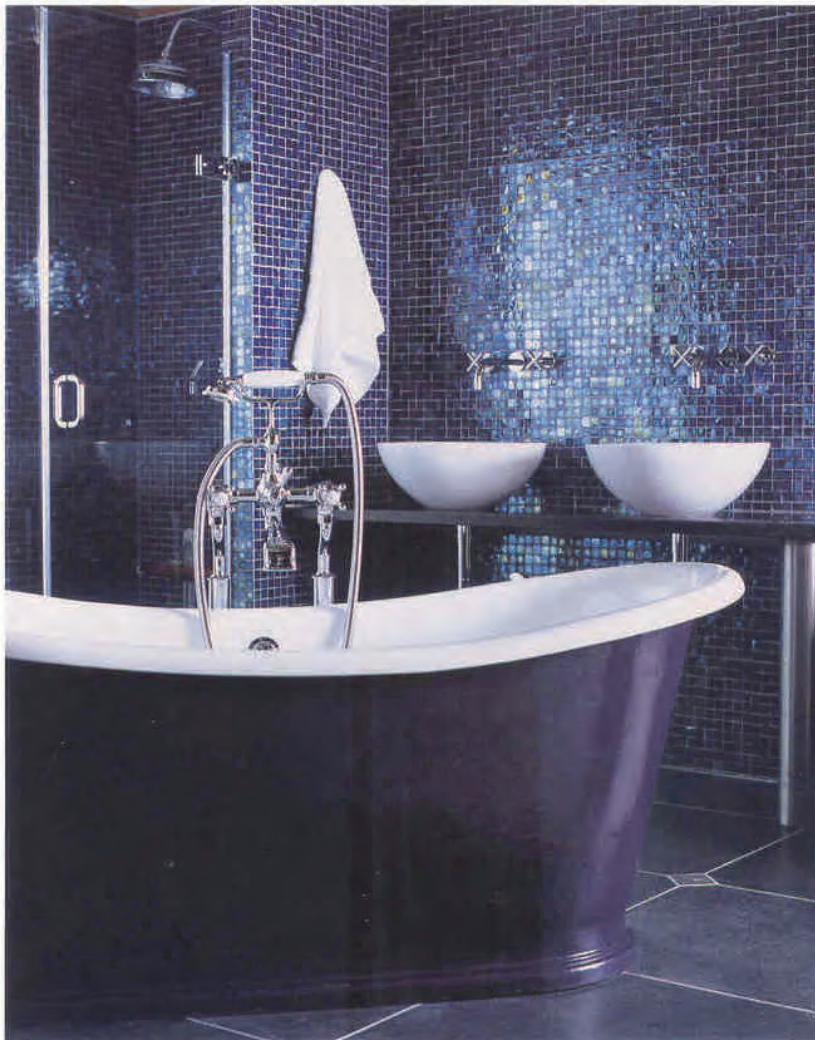
Le Bain de Bateau: based on an original 18th century design and cast in iron, this decadent roll-top bath from Fired Earth is in a class of its own.

Le Bain de Bateau bath; iridescent glass mosaic wall tiles; Eclipse bowls; Eden shower enclosure; silver blue slate floor tiles; Classic chrome & Metro chrome brassware. Fired Earth Interiors Tel: 01392 878252